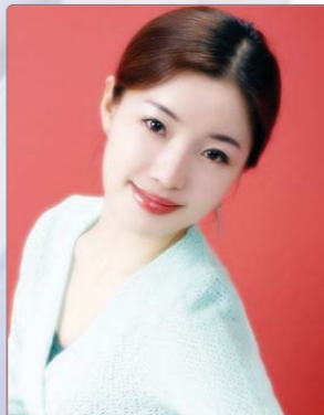
Dance_lee, ju mi